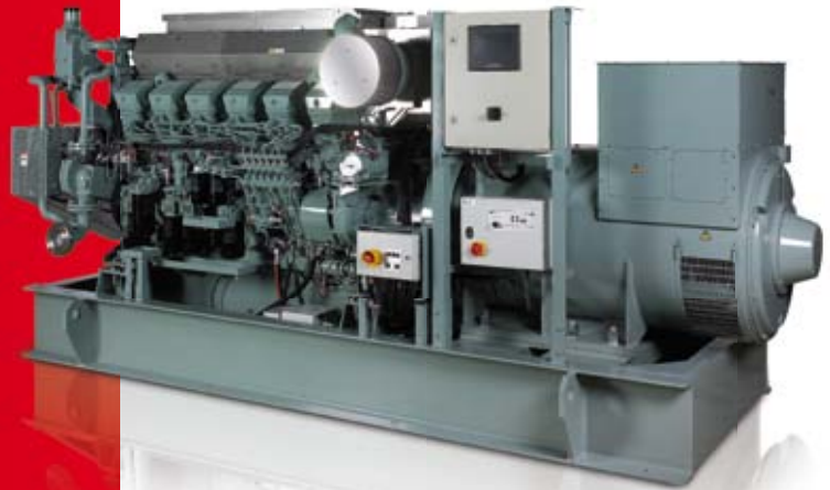
Mitsubishi Auxiliary Sets