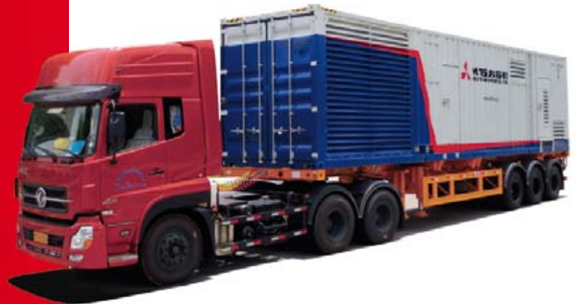
containerized power generation and cogeneration solution